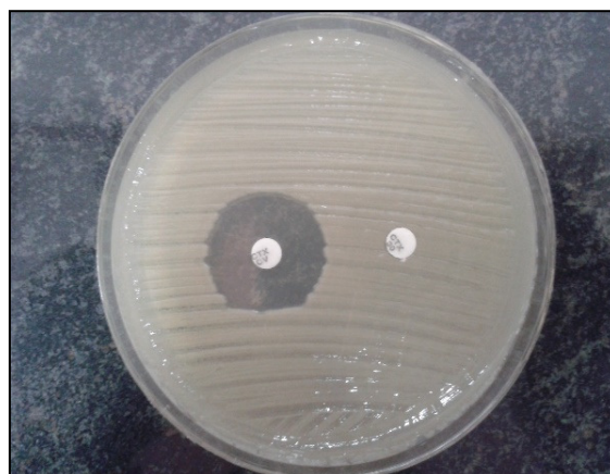
Fig. 1. Confirmatory combination disk method, the appearance of ESBL producing isolate.