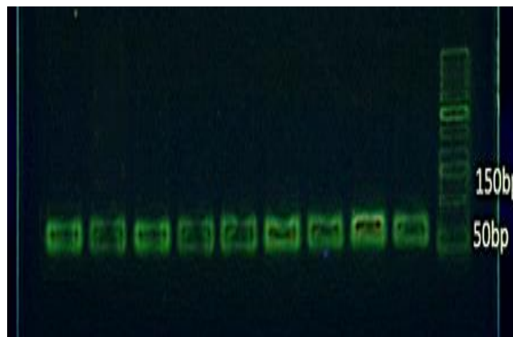
Fig. 1. Electrophoresis analysis of the katG and gyrA gene PCR on 1.5% agarose gel. 130-bp products amplified from the gyrA gene of M. tuberculosis isolates (A) 72-bp products amplified from the katG gene of M. tuberculosis isolates (B).