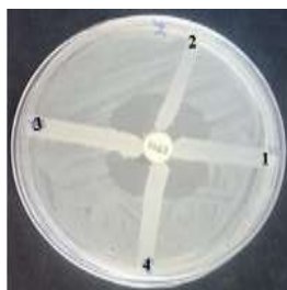
Fig. 1. MHT: All isolates showed a positive result.