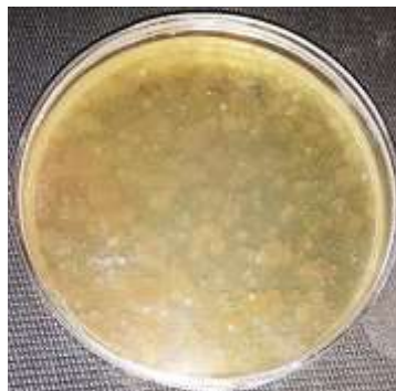
Fig 1. Double Agar Overlay plate used to separate phage. Clear areas were phage plaques. This plate was from before the optimization experiments

of the culture medium was 7. The results of the optimization tests are shown in Figure 2. Isolated phage plaques were formed as distinct transparent dots on the plate surface in these optimized conditions. Figure 3 shows the image of a Double Agar Overlay plate after optimizing the isolated bacteriophage growth conditions.