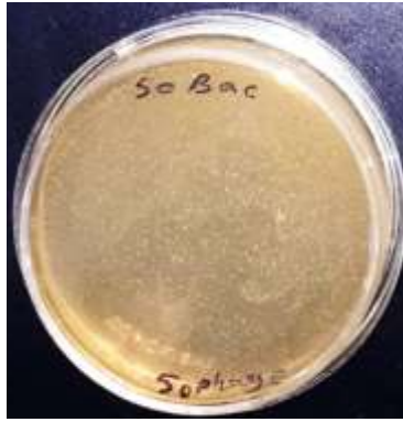
Fig. 3. Double Agar Overlay plate used after the optimization of the isolated bacteriophage growth conditions. In optimized conditions, isolated phage plaques were formed as distinct clear dots on the plate surface.