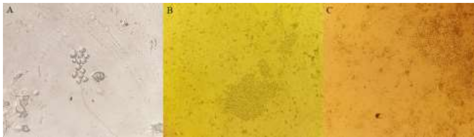
Fig. 2. Results obtained from fusion and hybridoma cells, A: Colony formed after one week of incubation in complete medium + HAT 2X (40X), B: Desired colony growth in complete medium + 2% HT for one week (10X), C: Desired colony growth in complete medium + HT 1% for one week after transfer to a 6-well plate