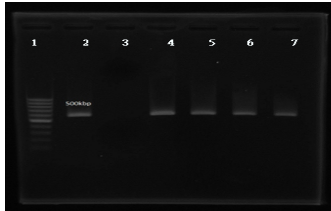
Fig 1. Analysis of clbB gene on 1% agarose gel. From left to right; lane1, ladder 100bp, Fermentase Co. lane 2: Positive control, gifted from France, University of Toulouse; lane 3: Negative control; lanes 4-7, PCR products of a few samples with clbB gene. The size of PCR product for clbB gene is 500 bp.

were positive for both clbB and clbN genes as simultaneous; so there were no significant differences between clbB , clbN and colorectal cancer ( P>0.05 ).