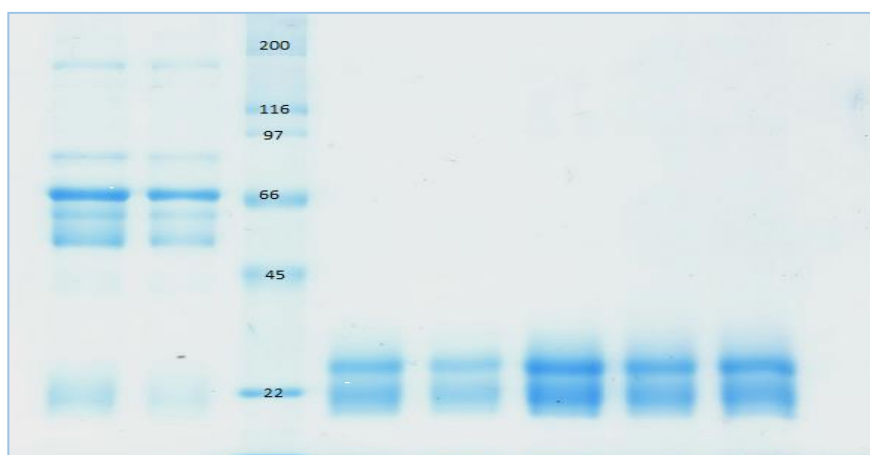
Fig. 1. SDS-PAGE of purified F(ab')_2 fractionated with ammonium sulfate and caprylic acid at various concentrations. The electrophoresis was carried out in 10% acrylamide under reducing condition.