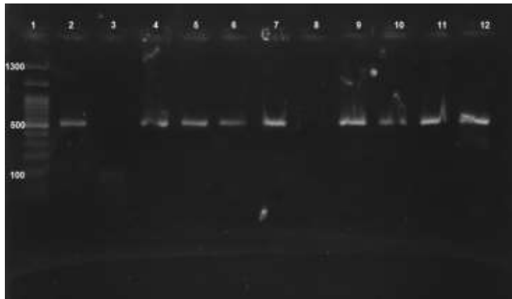
Fig. 1. Observation of PCR-products of beta-globin gene: Lane 1 is DNA size marker, lane 2 is a positive control, lane 3 is a negative control, and the other lanes are samples.