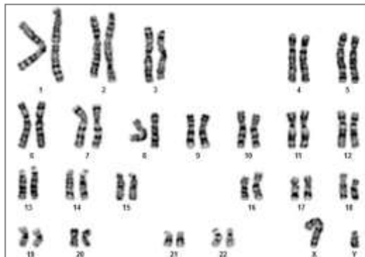
Fig. 3. 60 metaphase spreads were studied on the basis of the GTG technique at 500-550 band resolution